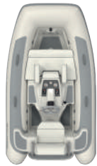
TURBOJET 285 3 PERSONS