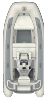
TURBOJET 385 5 PERSONS