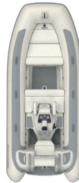
TURBOJET 445 6 PERSONS

Specification subject to change without notice. Dimensions and weights given are for guidance only and are subject to variation.