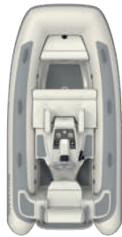
TURBOJET 325 4 PERSONS